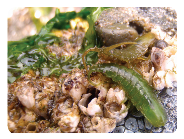
Fig. 2: Intertidal Idotea wosnesenskii , Eagle Cove. We have conducted several feeding trials with these herbivorous isopods to investigate how dietary fatty acids and stable isotopes are stored in fast-growing juveniles. Photo and Iab work by Morgan Eisenlord (Duggins/Dethier group researcher).

into consumers. We have recently shown that different seaweeds and phytoplankton have very distinctive fatty acids. The second step is measuring how animals 'modify' and store different dietary fatty acid signatures. We have conducted feeding trials with several consumers (isopods; see Fig. 2) that have helped us to identify which biomarkers to focus our efforts on. The culminating step is to put the algal biomarker signatures into a 'prey library' and use some fancy math to calculate the likely contributions of these various food sources to the consumer given the consumer's own biomarker signature.